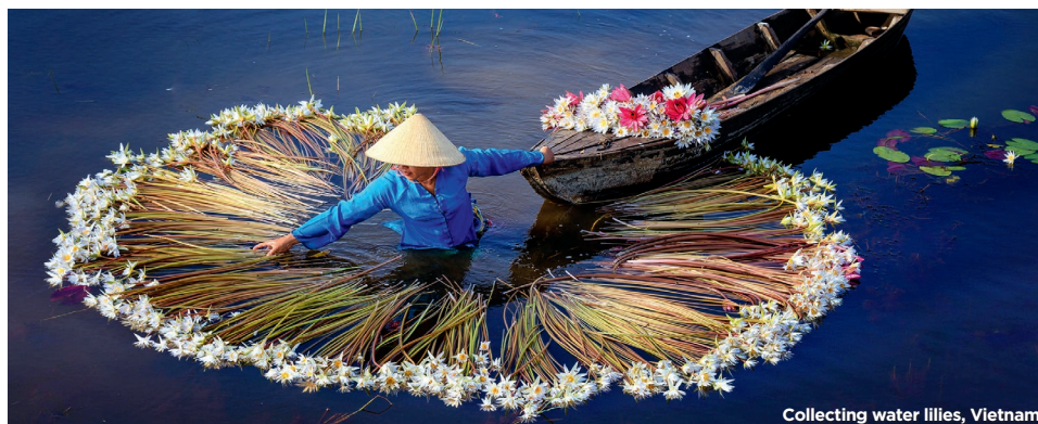
Collecting water lilies, Vietnam